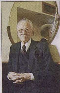
Ho Fan and his 1954 work, Approaching Shadow , right.

In his award-winning career that spanned 70 years, Ho won nearly 300