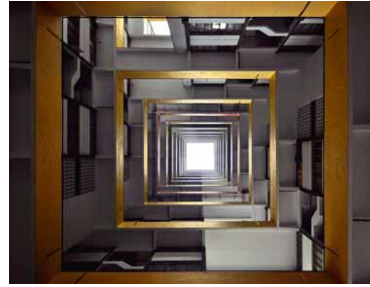
'This residential building in the NewTerritories has a unique style of architecture. I don't have a specific way to select buildings – I simply look up as much as possible, and when I see a pattern that catches my attention, I shoot.'

28 Lonely Planet Traveller December 2013 Lonely Planet Traveller 29