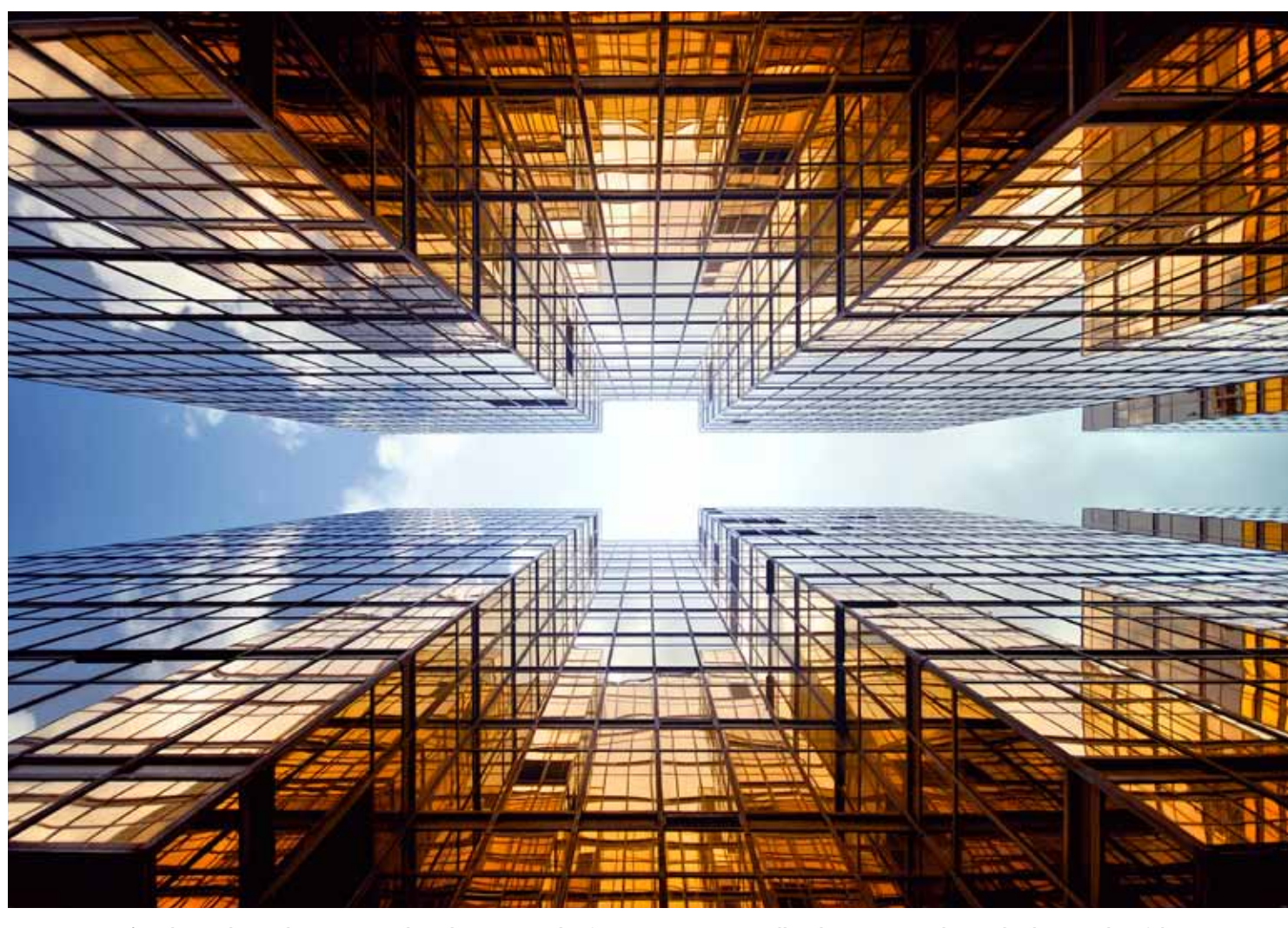
'On the Kowloon side, Canton Road is a shopping paradise for many tourists, as well as their temporary home, thanks to its plentiful selection of hotels. The China Hong Kong City complex, pictured here, is probably trying to attract people who have a crush for gold.'