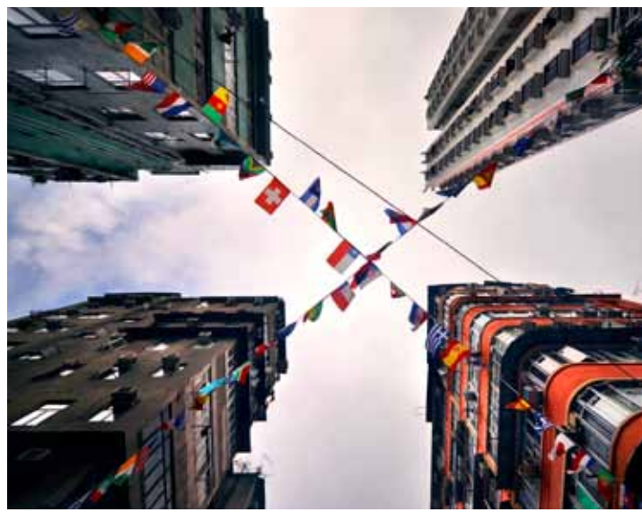
'Temple Street Market welcomes tourists every day and night from all over the world, like the flags that are hung above the crossing with Nanking Street. There's all kinds of bargains here, from electronic goods to counterfeit fashions.'